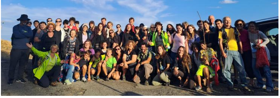
fCollection of pictures from the Servas Summer camp in Sicily, August 2022