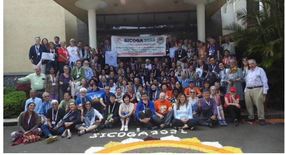
Group photo of our fantastic participants.