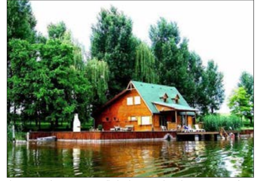
The Servas Youth New Year Party will take place in Nagyhörcsökpuszta in Hungary from December, 30th to January, 4th 2018.