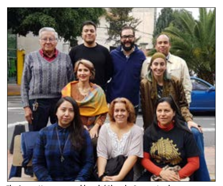
The Servas Mexico national board