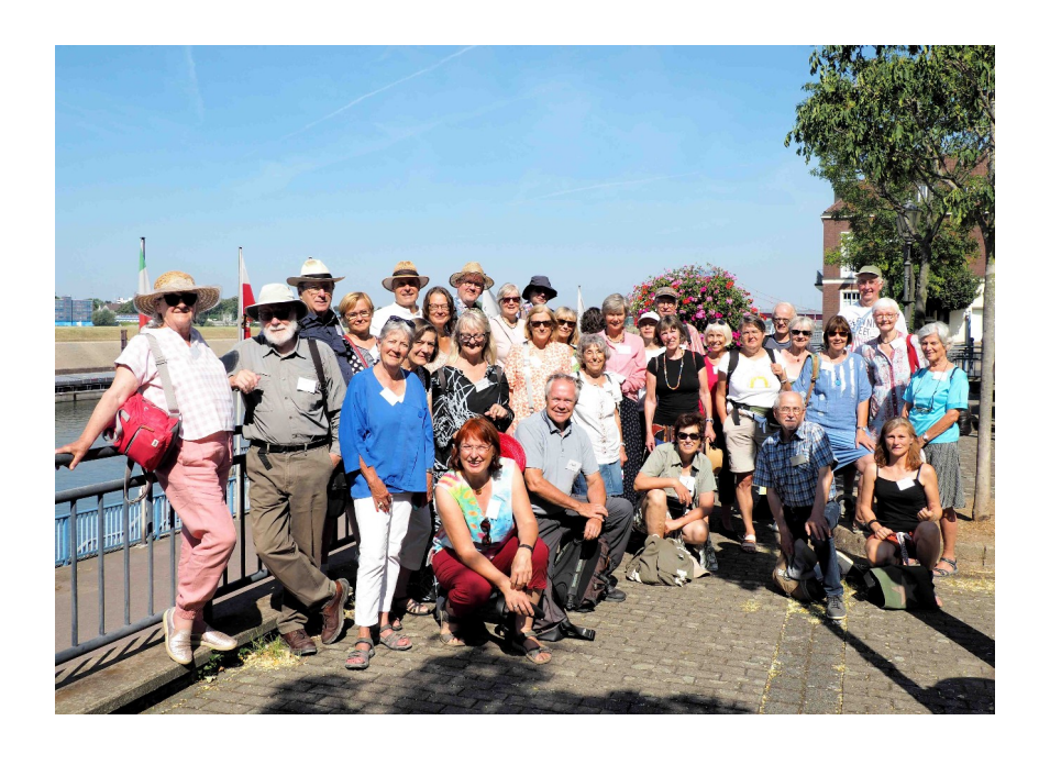
Auf Wiedersehen and goodbye :-)

The meeting was a great success and we're already looking forward to next time: we are planning another meeting in the Ruhr region in 2024 and the focus will be on Bochum.