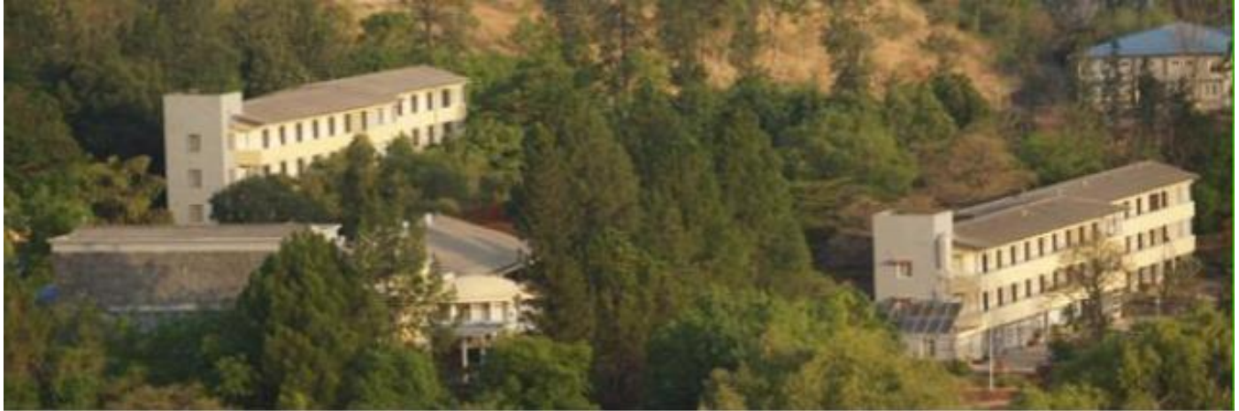
Asia Plateau is located in the western hills of India and overlooking the Krishna Valley.

The venue will be Asia Plateau in the Western hills of the Indian state of Maharashtra at Panchgani, 100 km from Pune.