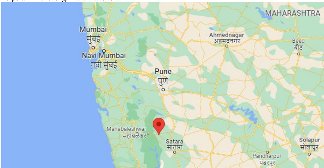
Asia Plateau is situated in Panchgani, 100 km from Pune, and 248 km from Mumbai in the Indian State of Maharashtra.