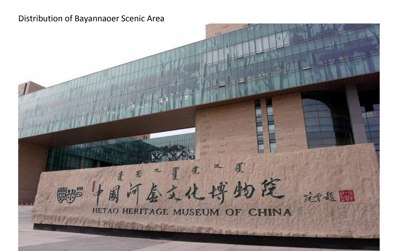
Hetao Heritage Museum of China