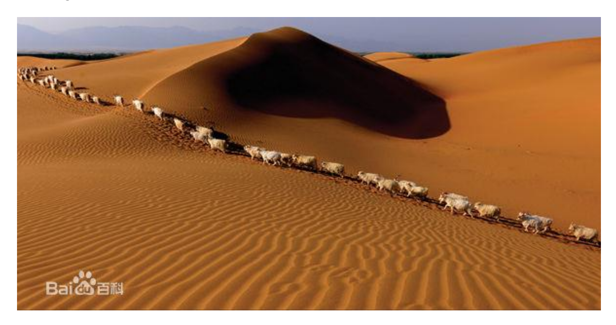
Ulan Buhe Desert