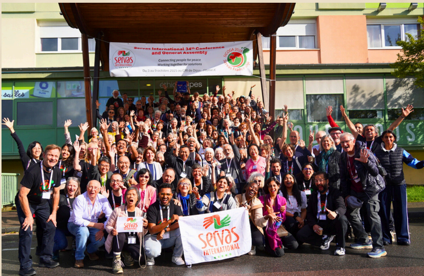
SICOGA 2025 Group Photo