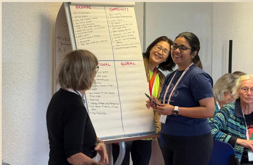
From one of World Cafe