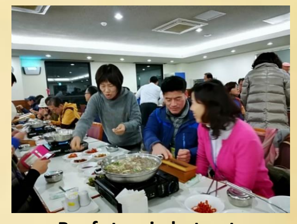
Beef stew in hot pot

We tasted dinner at the restaurant after the workshop to evaulate the quality of the food and see the structure of the cafeteria. Dinner was okay without complaints..