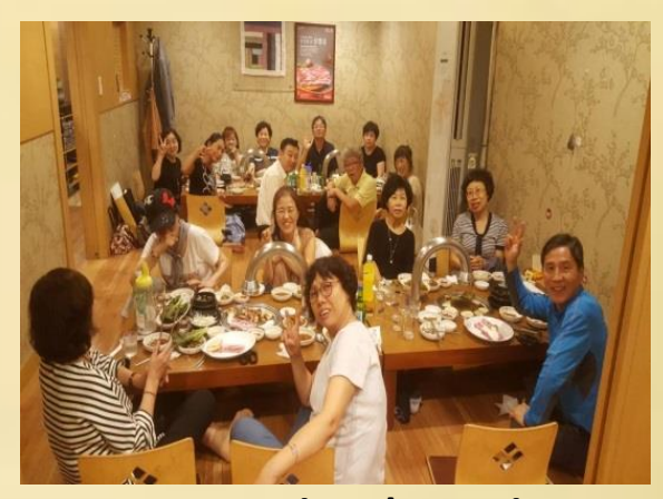
Busan regional meeting