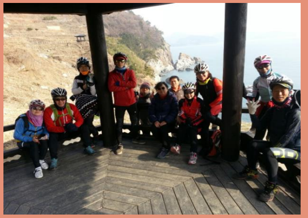
Riders taking a rest on the way

22 Servas members from all over the Korea gathered in Namhae, a coastal city in the southern part of Korea from January 19<sup>th</sup> to 23<sup>rd</sup> and rode 183 kms along the beautiful coast, stopping for the appetizing seafood fresh from the sea. They tasted raw oysters, sashimis of anchovies, mullets, and other fish, spicy soup of mullets, catfish and also oyster soup along with shellfish, roasted eels and the famous Namhae spinach.seasoned with sesame oil and powder.