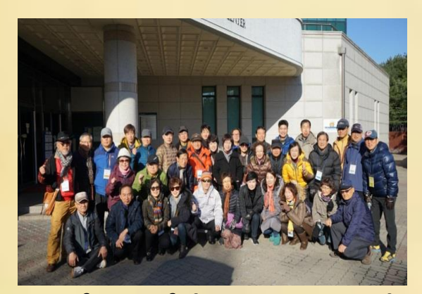
In front of the international Youth Center Youth Hostel

The last part of this meeting was walking from the Youth Hostel to Suwon Hwasung Fortress before farewell.