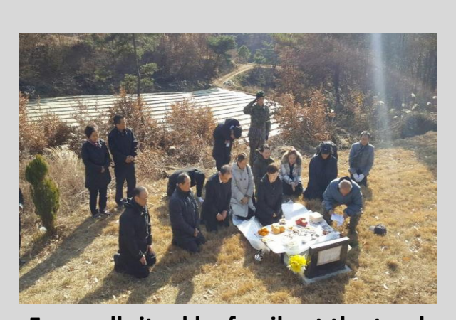
Farewell ritual by family at the tomb