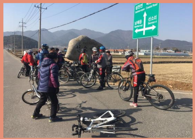
Riders preparing for the ride

22 Servas members from all over the Korea gathered in Namhae, a coastal city in the southern part of Korea from January 19<sup>th</sup> to 23<sup>rd</sup> and rode 183 kms along the beautiful coast, stopping for the appetizing seafood fresh from the sea. They tasted raw oysters, sashimis of anchovies, mullets, and other fish, spicy soup of mullets, catfish and also oyster soup along with shellfish, roasted eels and the famous Namhae spinach.seasoned with sesame oil and powder.