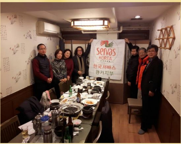
Gyeonggi regional meetingsmall but powerful team