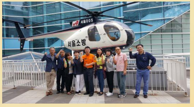
Seoul region has another meaningful event-visiting Seoul City Fire Museum and learning about fire security