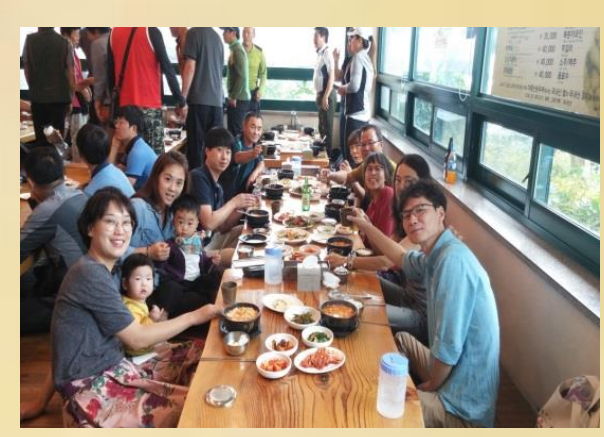
The youngest region-Jeonbuk regional meeting