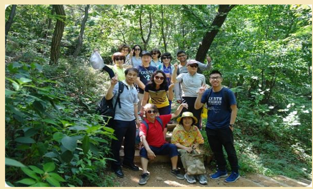
Seoul regional meeting always have a special event, this time walking in the forest

11 regions of Servas Korea have a regular meeting, usually 4 times a year to bond and share Servas activities.