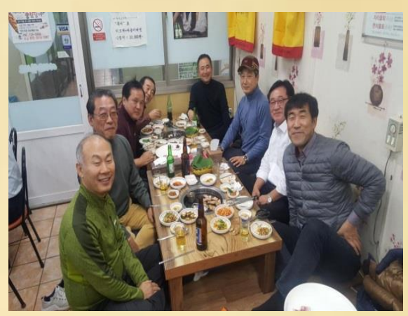
Jeju regional meeting