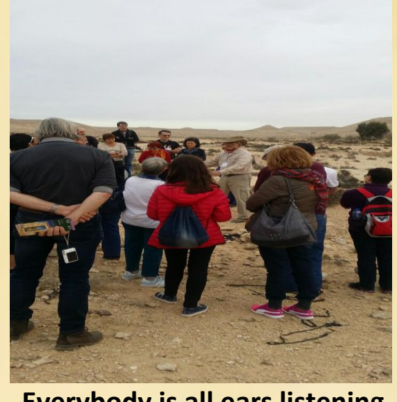
to the explanation in Negev Desert, Israel