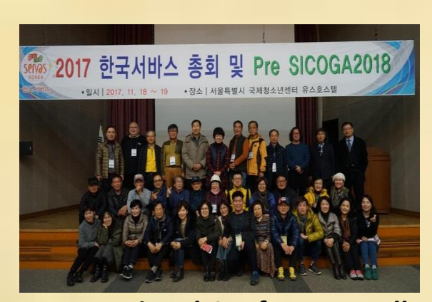
International Conference Hall