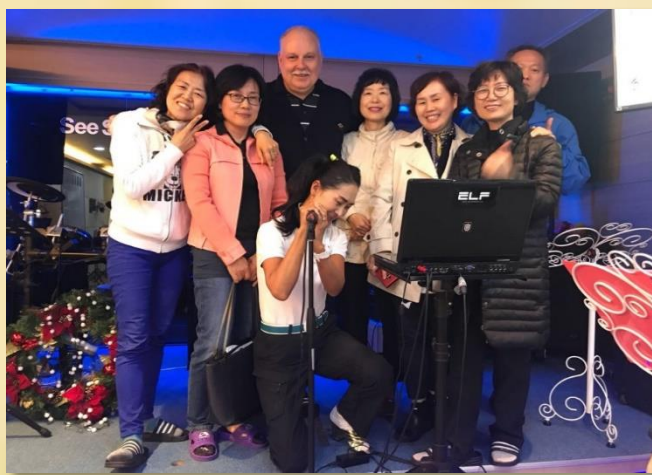
Nobert visiting a music workshop with Busan members