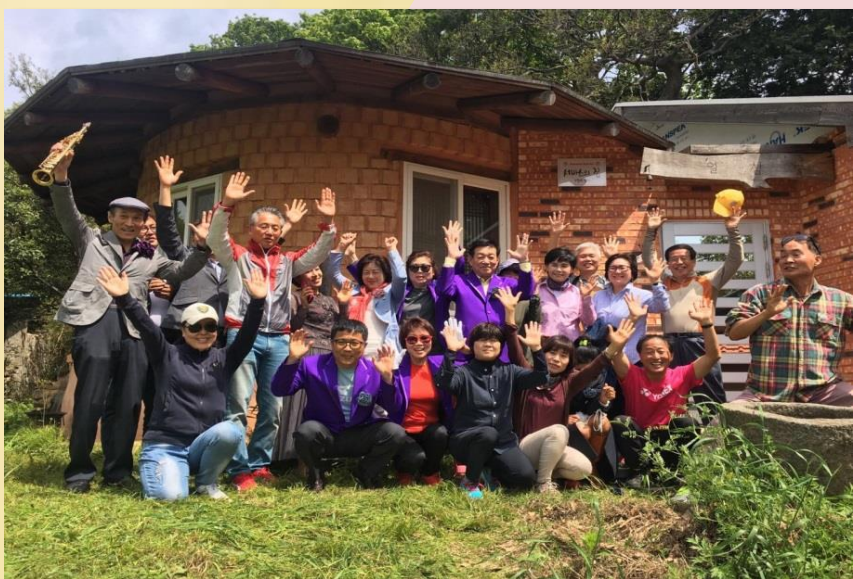
Opening of Servas Home for Servas Korea(May 4 th ) in Namhae city

On May 4 th , a second home for Servas Korea opened at Namhae, one of beautiful many islands located in the south of Korea. It wasn't until 1973 when the island was linked with the mainland by a bridge. The island is well-known for its splendid scenic beauty, unique culture, and the local's strong vitality to maintain their livelihood. The natives are so proud of their island that they even call this place a 'Treasure Island'. It produces garlic, spinach, sweet potatoes not to mention lots of sea weed and different kinds of fish.