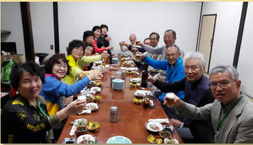
Welcoming party for Korean lady bikers