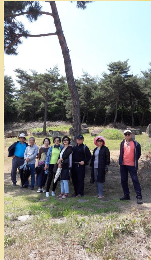
Jeonbuk regional meeting looks like a family gathering