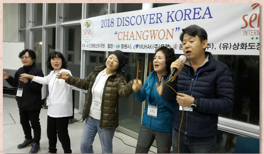
The performance by Chungnam District

Then came the socializing time; each Servas district introduced its members, followed by singing and dancing, entertaining the audience.