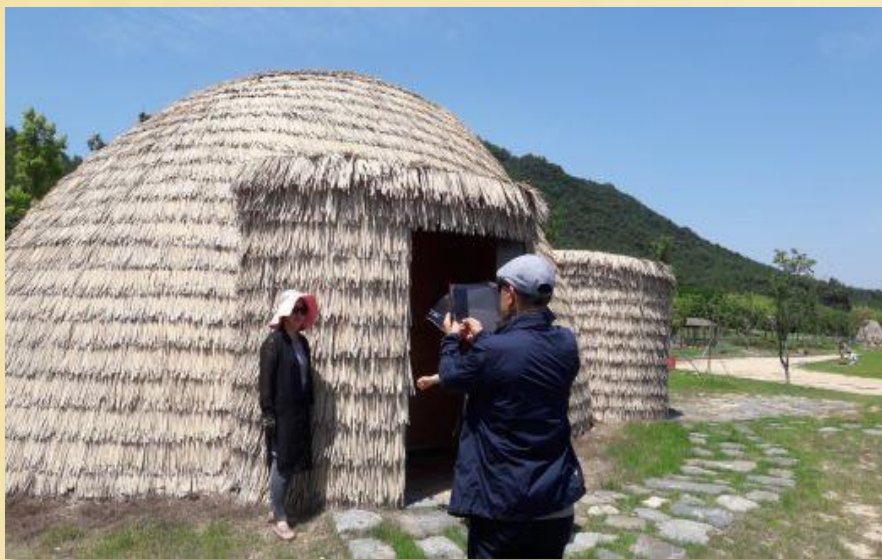
Enjoying Dolmen Reserve Park by Jeonnam region