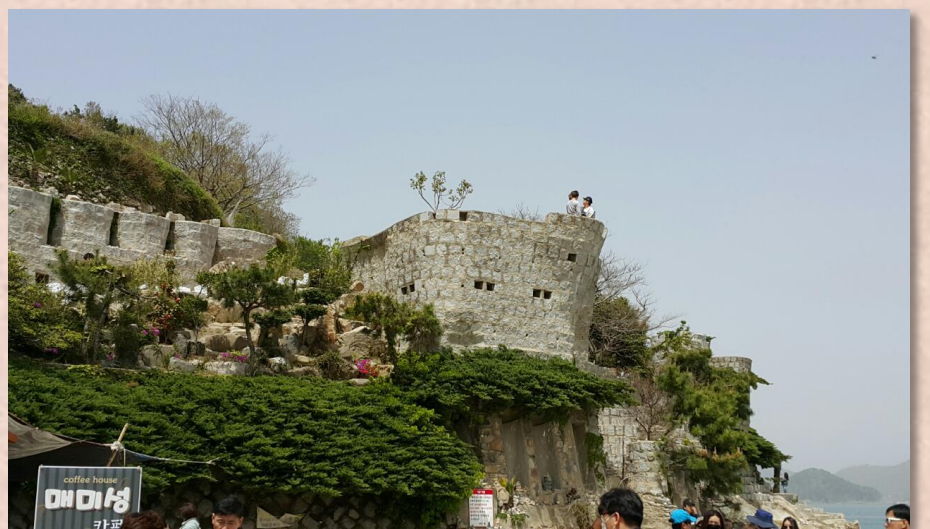
Walking along the coast at Jinhae Marine Park

The next morning after breakfast, we were separated into two teams; one for the trekking to Sirubong mountain and the other to Jinhae Marine Park and the birthplace of Youngsam Kim, one of Korea's former presidents.