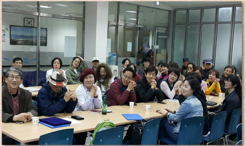
In the middle of the general meeting