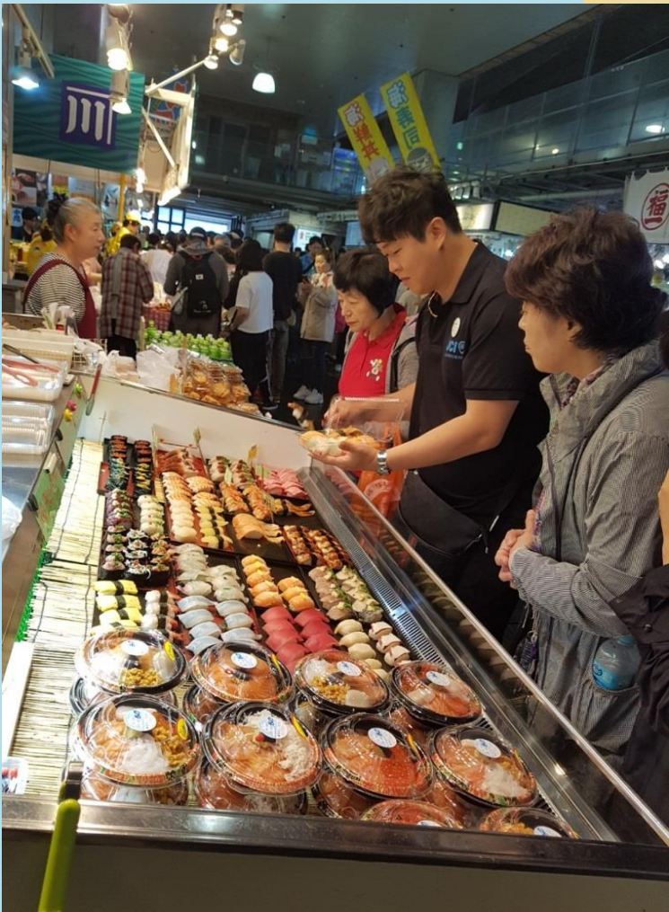
Inside the Karato Fish Market: can’t decide which sushi to choose