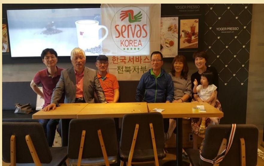
Walking in the Ungok Wetland(Jeonnam region)