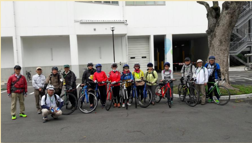
Cycling, sightseeing and bonding