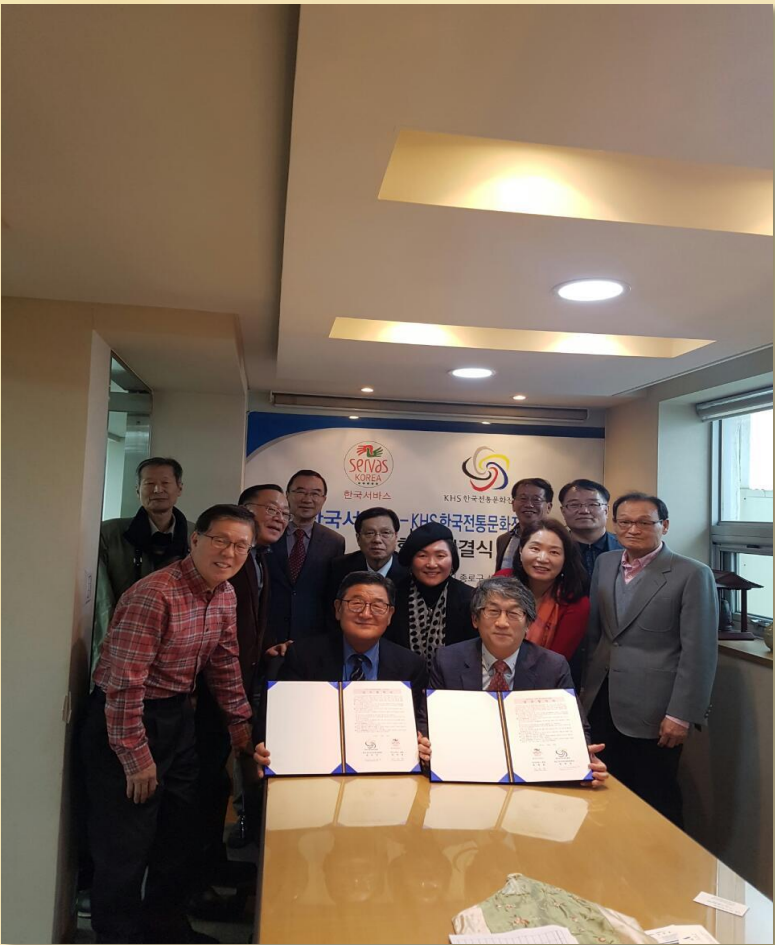
Members of two organizations posing for the photo