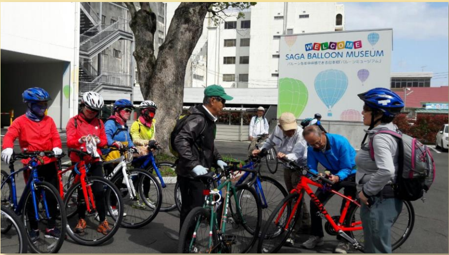
Last minute checking before starting cycling