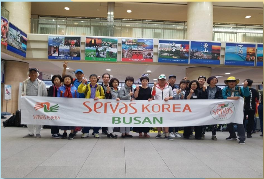
At Shimonoseki Ferry Terminal