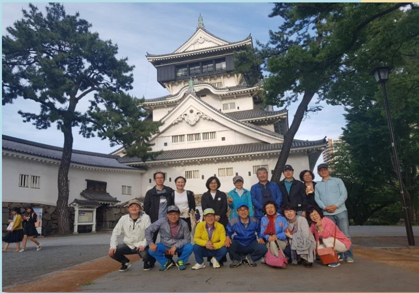
Kokura Castle in Kokura city