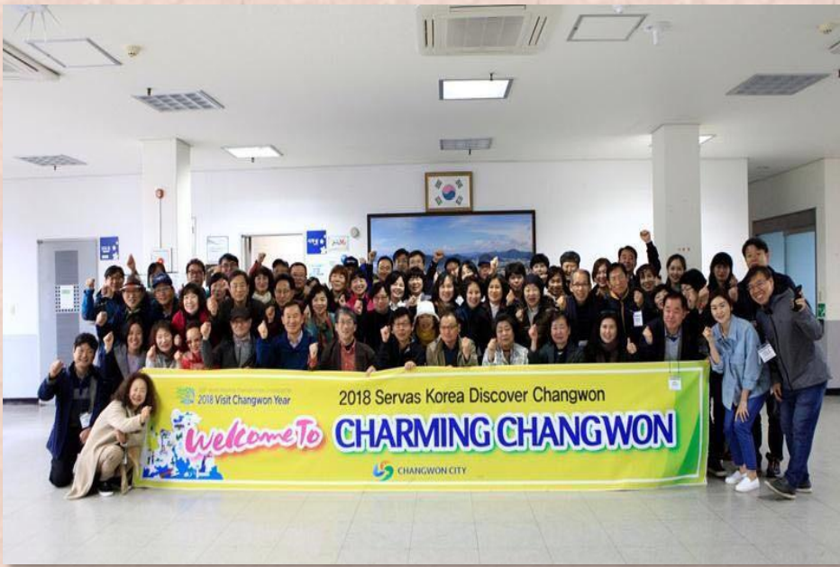
Welcome to Changwon!

The venue for the event was Jinhae Youth Trainin Center. It is placed at the foot of Jangbok Mountain, facing the Jinhae bay. Jinhae is one of the five counties in Changwon city and is the biggest naval port of Korea where the Naval Academy and the Navy Headquarters are positioned.