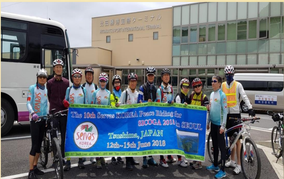
Servas Korean Riders posing in front of Hitakatsu Ferry Terminal upon arrival