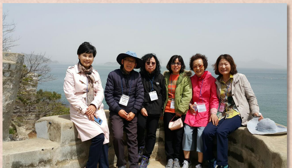
A relaxing and bonding moment with Servas friends