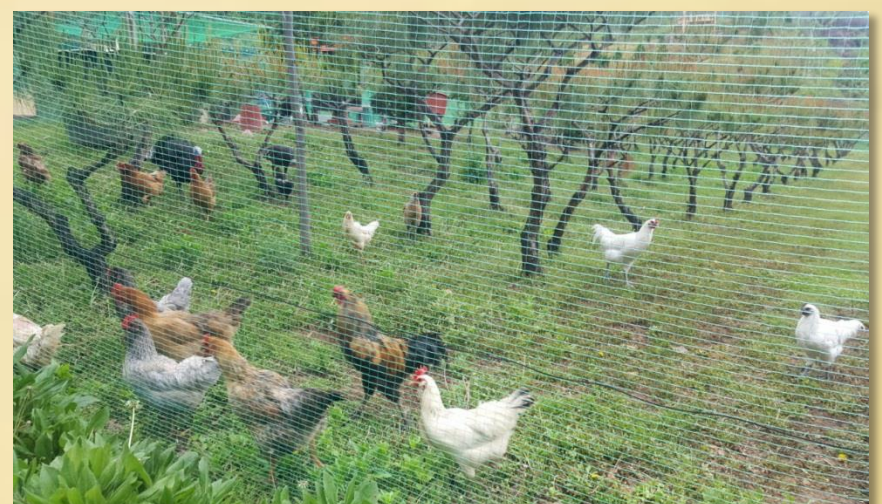
Mr.Cho, Younghae's chicken run (He's waiting for Servas travelers)