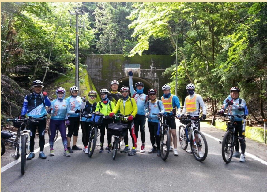
Taking a break in front of a tunnel

Servas International Peace Riding Club had their 10 th event in June by riding in Tsu shima Island in the far south Japan. All fourteen members joined the bicycling and rode total 156kms during June 12 th – 15 th . It was kind of a pilot event to practice and prepare for the SIPR right after the SICOGA2018. They finished the riding successfully despite some unexpected obstacles and episodes.