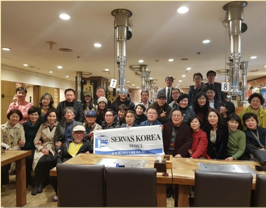
Seoul regional meeting attended by 37 members