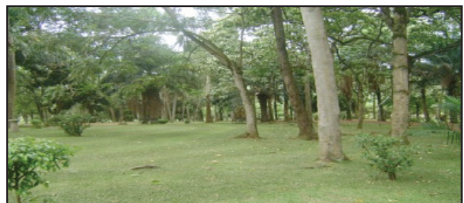
Grounds at Lweza