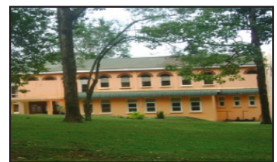
Conference rooms at Lweza