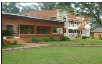
Reception at Lweza

Participants will get to know each other, give country reports, present case studies, and help create a history of Servas. North-south links will be considered, as will various web developments and relationships with other organizations. The future of Servas will be explored, the value of its