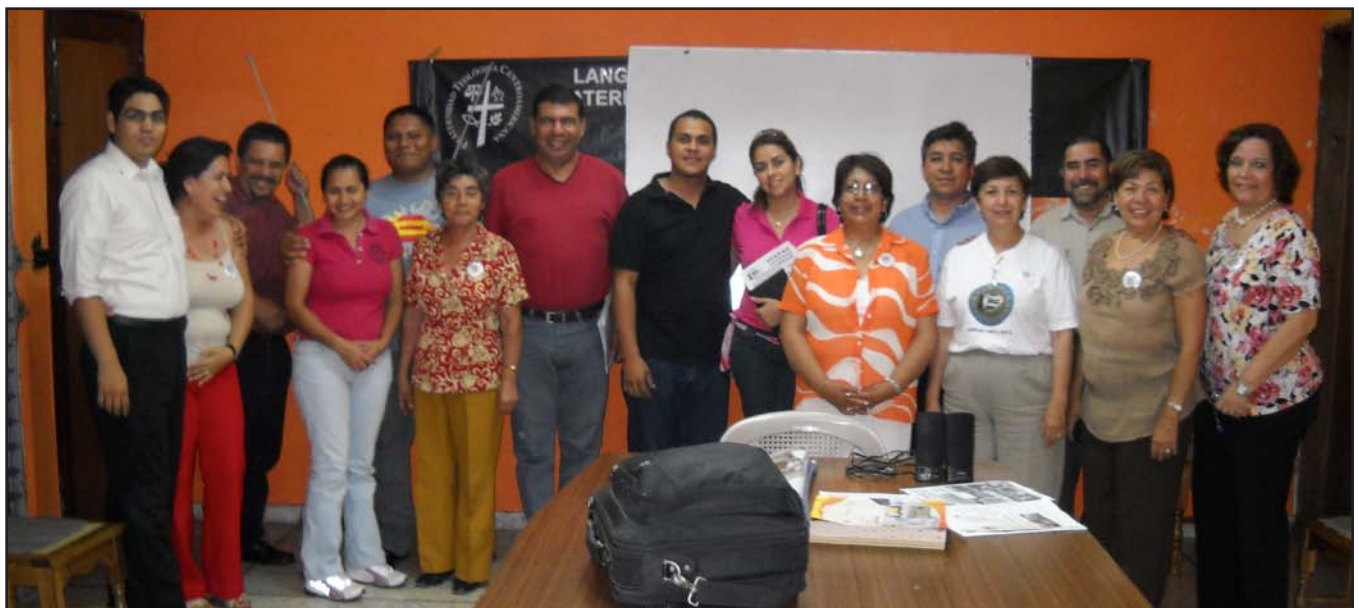
Attendees from Guatemala, Honduraas and El Salvador

Fue agradable ver a nuestros amigos de Honduras y estamos seguros de que hicimos nuevos amigos en El Salvador. 📷