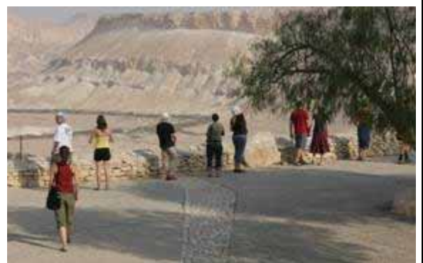
Trenches on the Golan Heights

We stayed in a youth hostel above Lake Galilee. The next morning we went uphill to the Golan heights – 900 meters above Lake Galilee. We visited areas of former battles with the trenches still in place, and had a look into Syria. We were told that there might be landmines in the area of the Golan heights so we had better stay on the road.