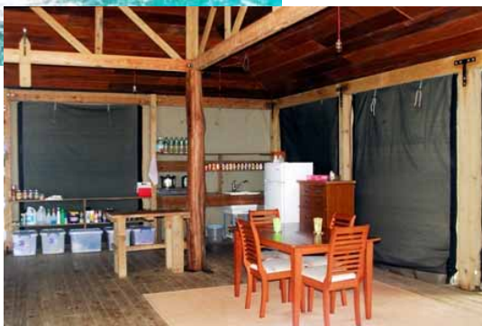
3. inside beach house