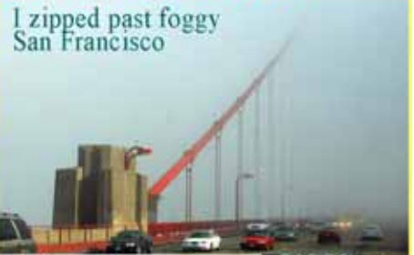
I zipped past foggy San Francisco