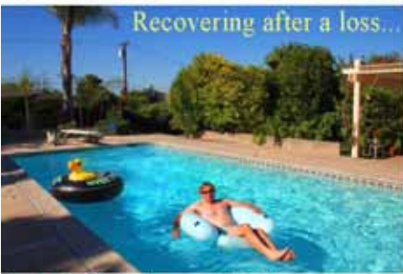
Recovering after a loss...