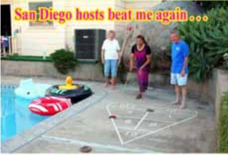
San Diego hosts beat me again...