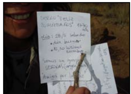
The statement we left with the flag