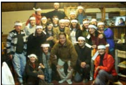
I handed our handmade trips with words about Servas purpose