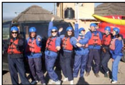
Rafting in the Mendoza river