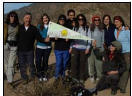
All the group