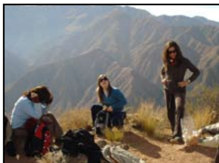
A stop on the way to the top