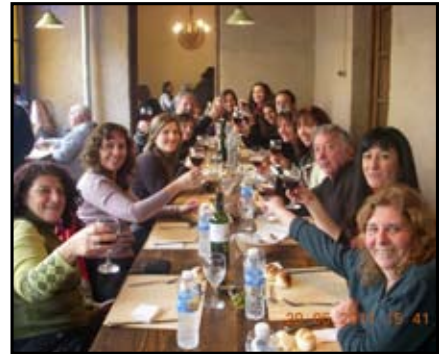
Asado in the organic vineyard