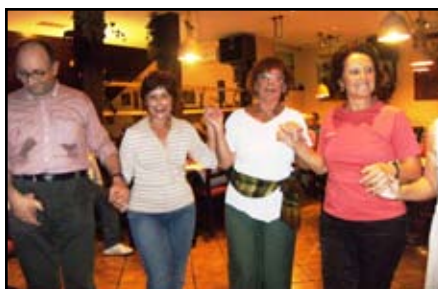
Dancing at the last Alpe Adria meeting, in Slovenia

Alpe Adria Servas meetings are held in the Countries near the Eastern Alps and Northern Adriatic Sea and are meant to let Servas members know each other in a relaxed context. There will be time for talking to each other, making excursions and walks, sharing food, singing and dancing!