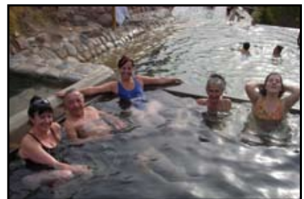
A group in the Cacheuta springwaters