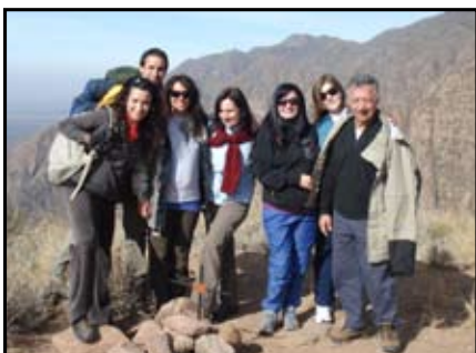
The group at the top of the cerro