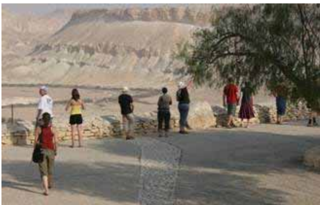
At Ben Gurion's burial place“

The next destination was the desert – going south to Be'er Sheva where Abraham, the Jewish-Christian-Muslim forefather, according to the Bible, started his spiritual journey. The first prime minister of Israel David Ben Gurion used to live in a kibbutz in the Negev desert during the last years of his long and interesting life full of challenges. He wanted the Israelis to „conquer“ the desert as he saw the future of Israel in the desert. His tomb is placed at a place where he and all his visitors have a splendid view into the desert.