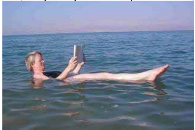
Floating in Jam haMelach

After this hike up- and downhill that was quite exhausting we went – well, swimming or better floating in the Dead Sea (that, by the way, is called „Salty Sea“ in Hebrew).