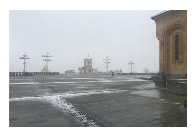
During the Church Service, snow slowly turned the square outside Holy Trinity Cathedral of Tbilsi into an ice rink.

In the beginning, there was the pretty Georgian script that I began learning in October 2021. I renewed my profile on workaway.com without any concrete travel plans yet. In this network I got to