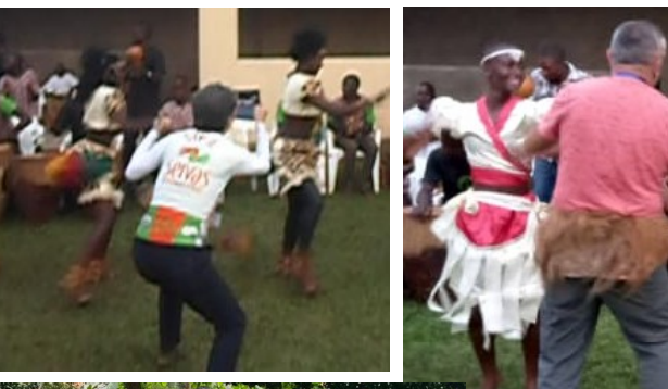
hind your back!