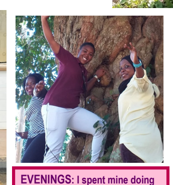
co-ordinating the newsletter team. Older youth went out on the town!