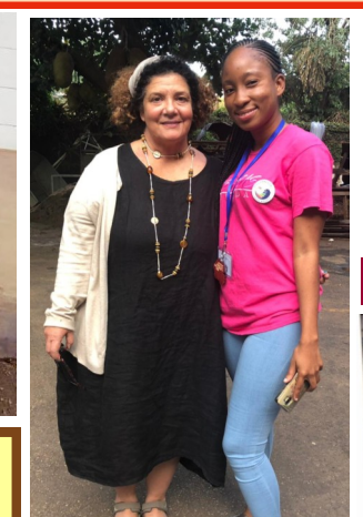
BIKE PEACE TOUR: Saturday 14th and the bikers' left for Jinja and everyone else left of ly/travel by land home. It looked like ch fun and I was ♥SO sad to miss it! ⊗